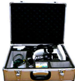
Aluminum carrying case